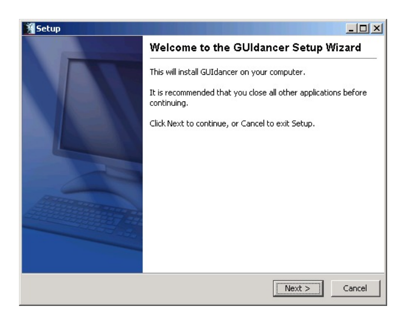
Figure 4.1: Welcome Screen

4. The license agreement will appear. Read it and accept it to continue. You can view and print this license later. It is saved in the Jubula installation directory and is called license-agreement.txt .